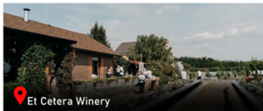
Et Cetera Winery

By sampling sparkling wines from Et Cetera you'll be pleasantly surprised by the combination of tender color, thin taste and berry aroma.