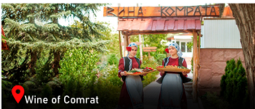
Wine of Comrat

Today the winery in Comrat is a modern production complex, processing 5-6 thousand tons of grapes and bottling more than 3 mil bottles of wine per year.